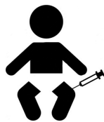
Measles & Vaccine

Number of out-patients visits made by individuals during the course of a year. More than 2 visits per person per year is an indication that there is demand on accessibility and utilisation of health care services