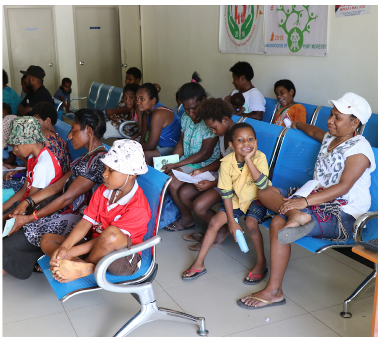
Outpatient services is one of the main health services CCHS centres provide in its facilities. This picture is the out patient waiting area for St Pauls Gerehu,

Number of outreach clinic per 1000 population under five years. Rural outreach provides an indication for preventative child healthcare and provinces should reach over 50