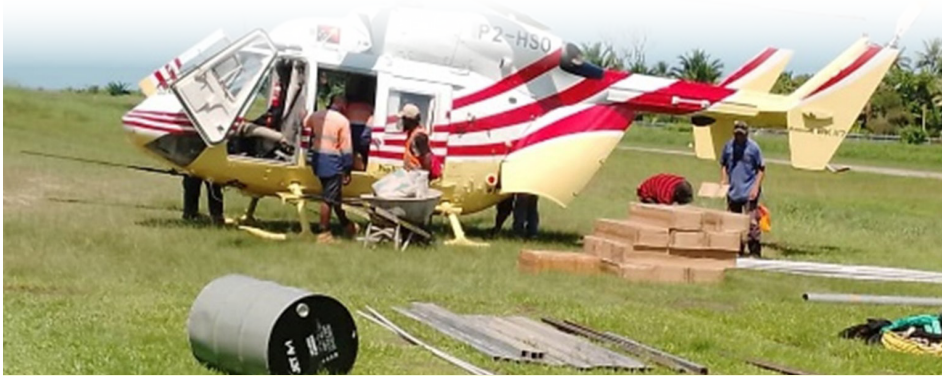
Solar kits airlifted to Kanabea Health Center in Kerema Diocese by chopper.

K anabea Health Centre, located in the mountains of Gulf Province under the Kerema Diocese, will soon have solar-powered lighting for the first time, ending decades of reliance on costly fuel generators and limited access to electricity.