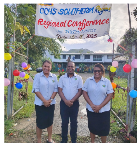
Staff from the CCHS National Office attending the Conference in Alotau, Milne Bay Province.

The conference concluded with a renewed commitment from all stakeholders to work together to advance health outcomes for communities across the Southern Region of PNG.