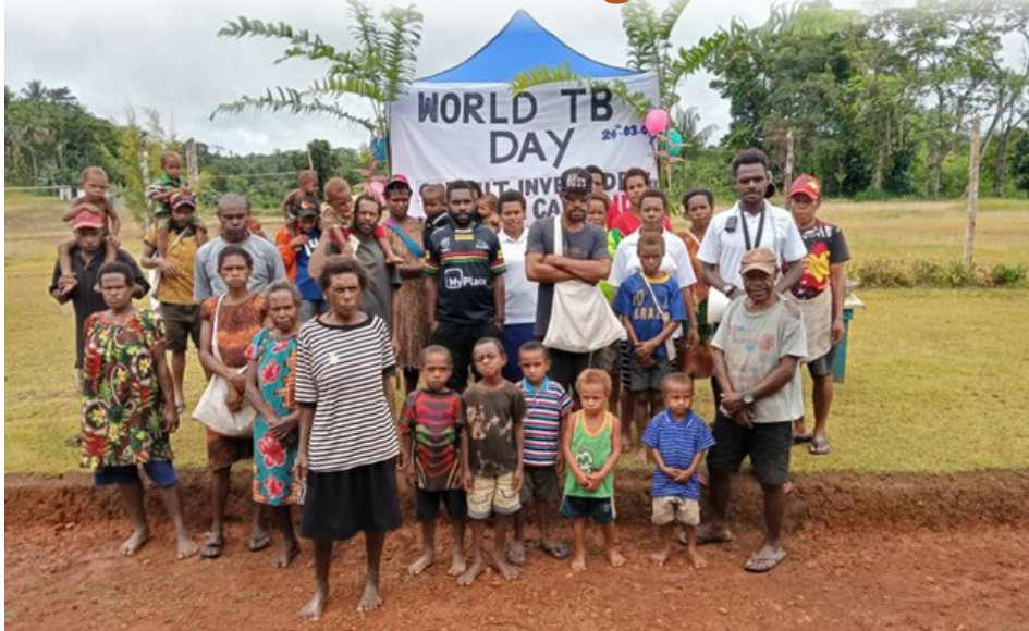
Communities around Tarakbits Health Subcenter showed up in numbers to celebrate World TB Day with the health workers.

Health workers from the Catholic Church Health Services (CCHS) in the Diocese of Daru-Kiunga (DKD) celebrated World TB Day on March 24th with this year's theme, "Commit, Invest, Deliver – Yes, we can end TB."