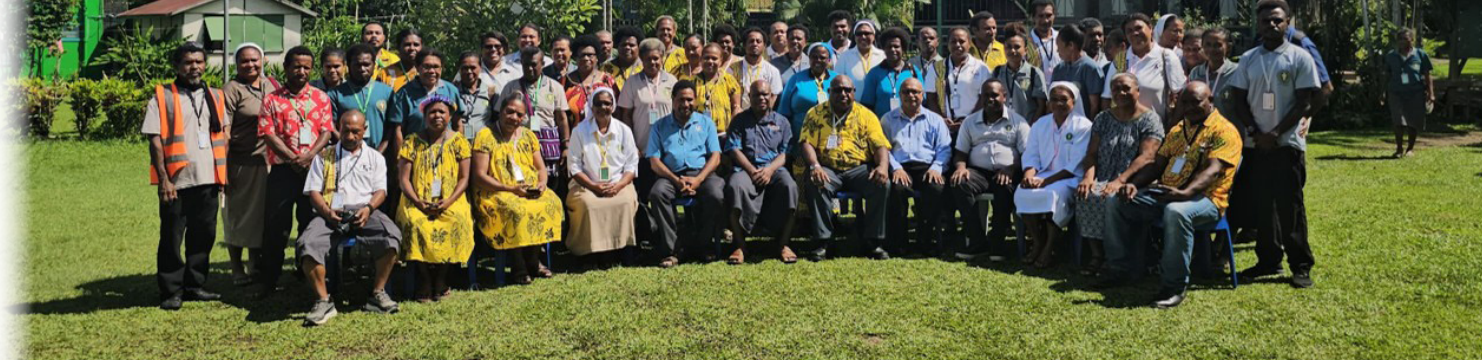
CCHS of Southern Region participating in the Southern Regional Conference in Alotau, Milne Bay Province.

Health representatives from Catholic Church Health Services (CCHS) across Papua New Guinea's Southern Region convened in Alotau from May 15 to 17 for the 2nd CCHS Southern Regional Conference, aimed at strengthening community health services and sharing public health strategies.