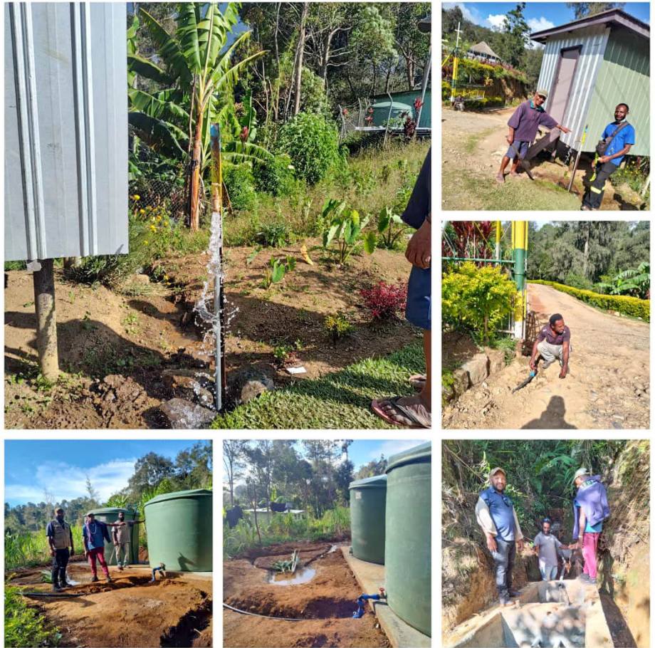
Newly installed water tanks at Yampu now provide access to clean water within the hospital vicinity and staff residential houses.

The initiative reflects ongoing efforts to strengthen health infrastructure and service delivery in rural parts of Enga Province.