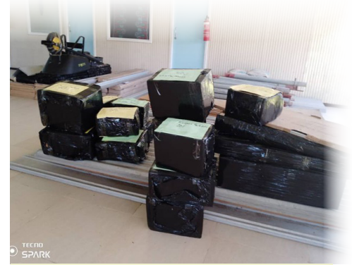
Solar kit materials all set for installation.