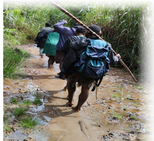
Health care workers and their bag carriers trekking through the bush and streams to Keman.

For decades, the Catholic Church Health Services has been the main provider of health care in PNG's remote areas. The Keman patrol shows that with careful planning and dedication, even the hardest-to-reach communities can receive life-saving care.