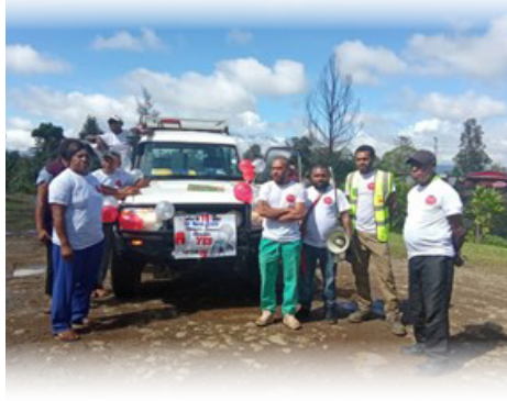
CCHS, Simbu PHA, and nursing schools giving TB Awareness to the population in Kundiawa town.