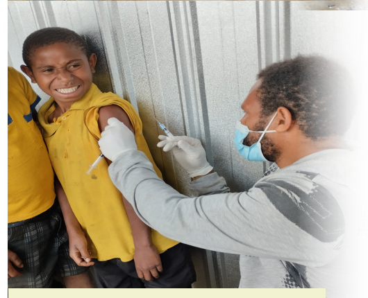
Staff from Yampu attending to school children at Keman Primary School.