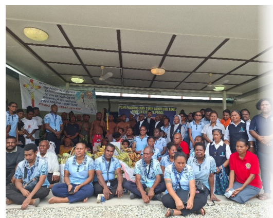
Catholic agencies in Port Moresby visited the haus krai of His Holiness Pope Francis at the Vatican Embassy, Korobosea.

nation, PNG's Catholic community remembers a humble servant of God whose compassion touched the lives of many.