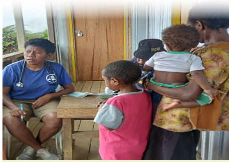
A mother and her children receiving medical attention from a healthcare worker.

From March 28 to April 1, 2025, a team from Yampu Health Centre in Enga Province traveled on foot to deliver critical health services to remote villages in Keman, Ambum Kompiam District. With no roads connecting these isolated communities, the health patrol brought essential care including maternal health, tuberculosis screening, nutrition programs, and vaccinations.